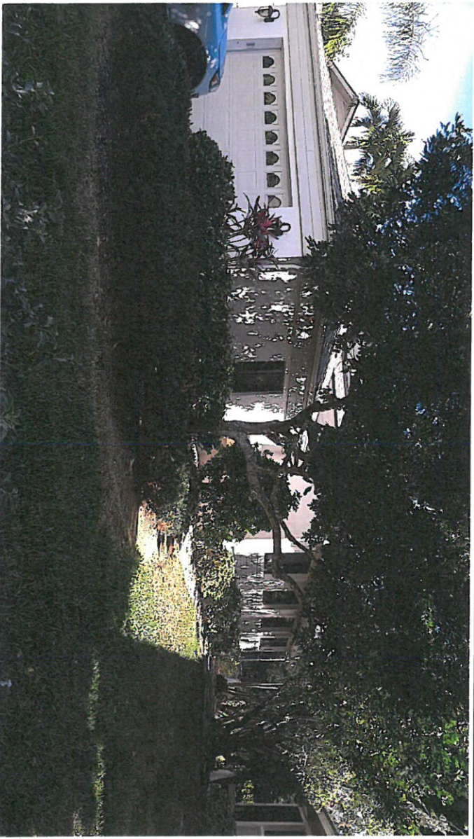
Photo Two Caption SIDE VIEW- 12/30/2016