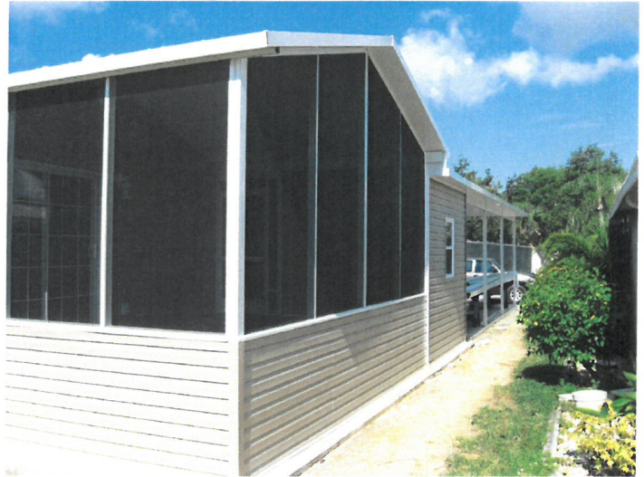
Left Side View Date Taken: 06/15/16