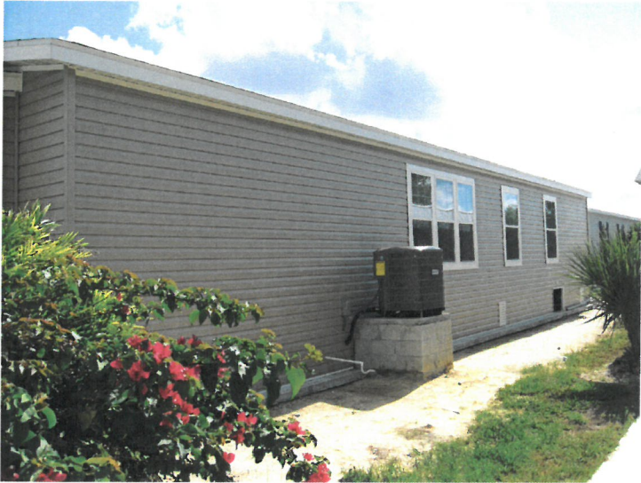
Right Side View Date Taken: 06/15/16