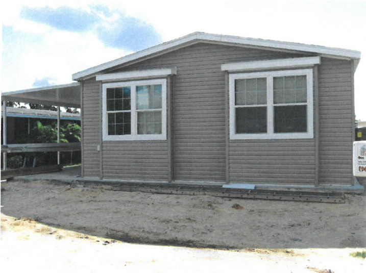
Front View Date Taken: 06/15/16