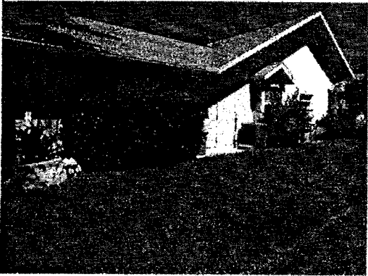
RIGHT VIEW 05-03-13