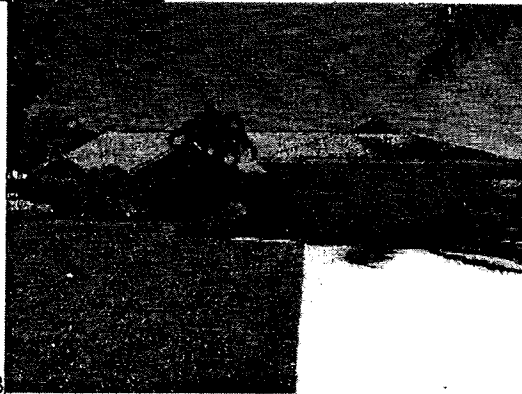
FRONT VIEW 05-03-13