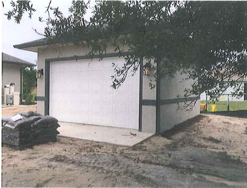
Front and right side view as of 10-07-16

If using the Elevation Certificate to obtain NFIP flood insurance, affix at least 2 building photographs below according to the instructions for Item A6. Identify all photographs with date taken; "Front view" and Rear view"; and, if required, "Right Side View" and "Left Side View." When applicable, photographs must show the foundation with representative examples of the flood openings or vents, as indicated in Section A8. If submitting more photographs than will fit on this page, use the Continuation Page.