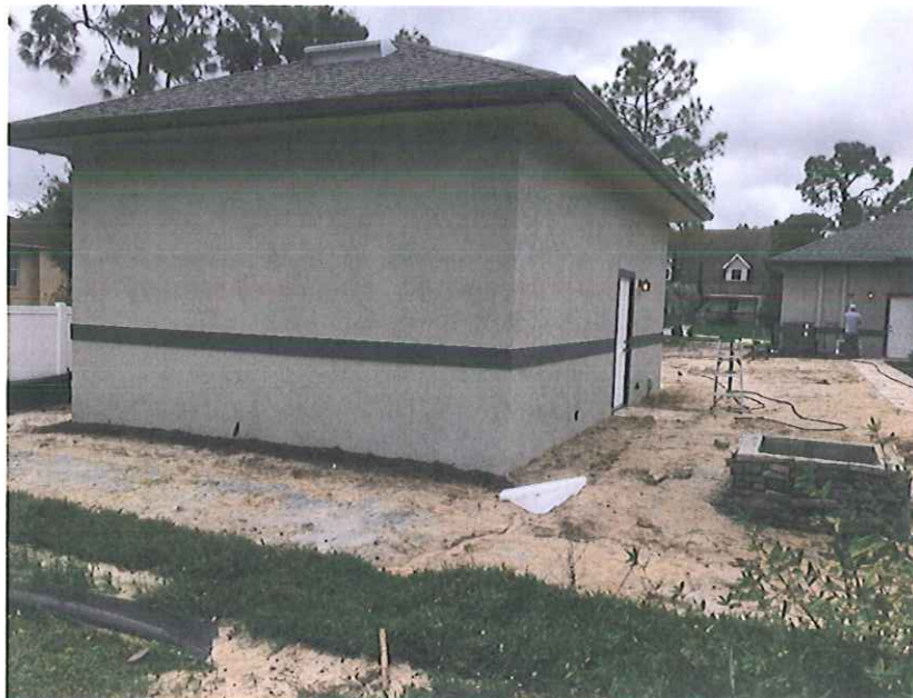
Rear and left side view as of 10-07-16