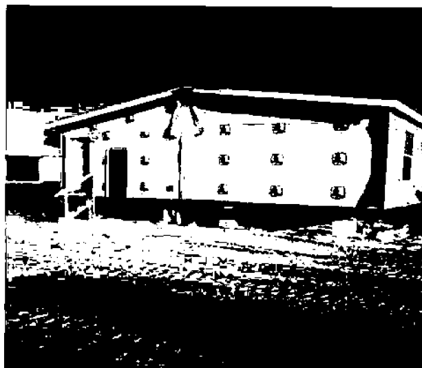
Left Side View Date Taken: 03/05/15