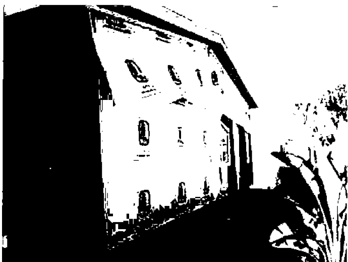
Right Side View Date Taken: 03/05/15