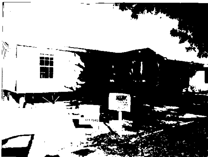
Front View Date Taken: 03/05/15