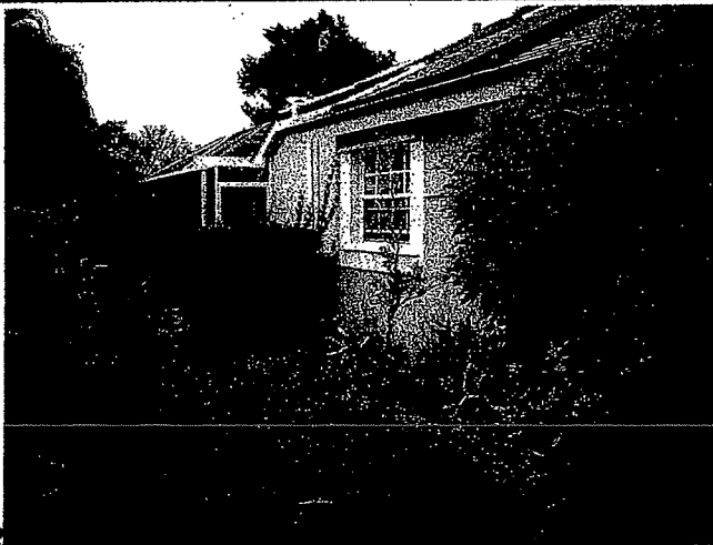
LEFT SW 02-09-12