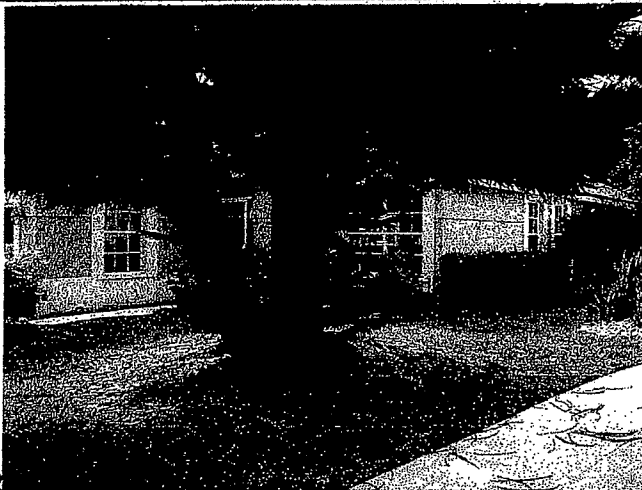
RIGHT NE 02-09-12