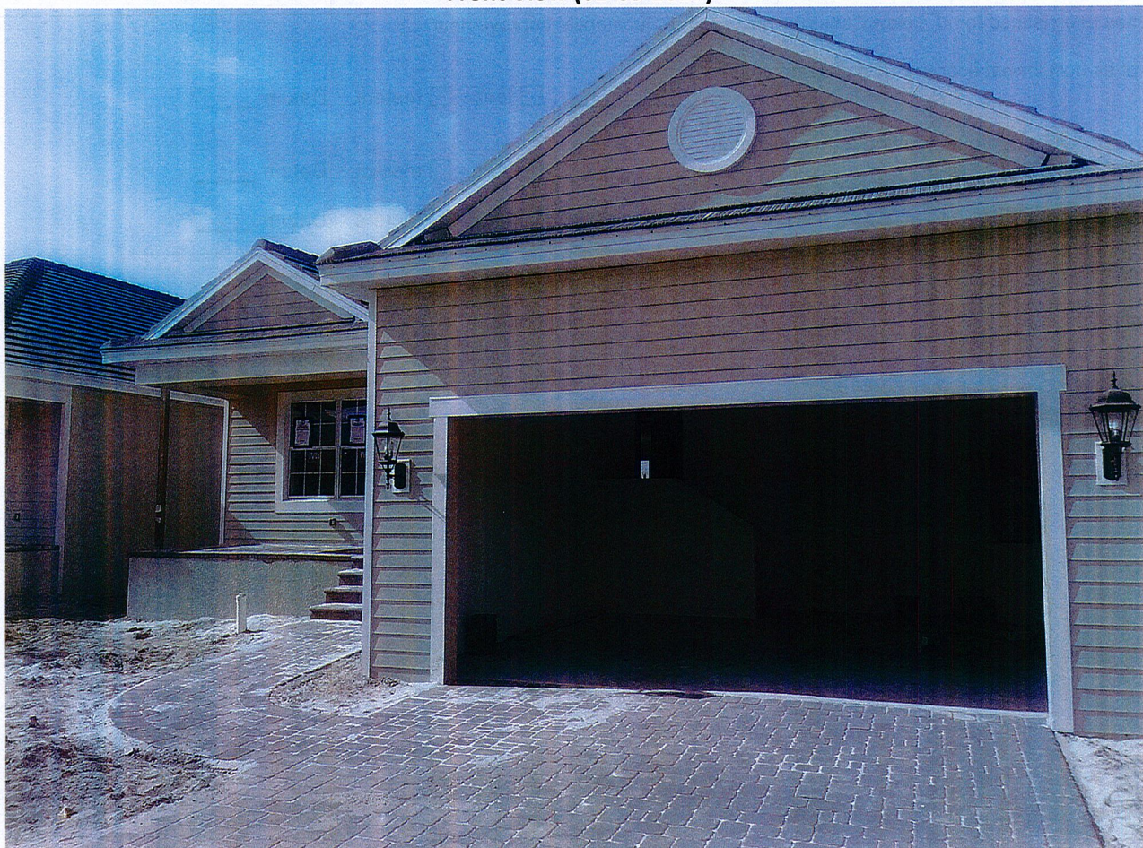
Rear View (01-03-2017)