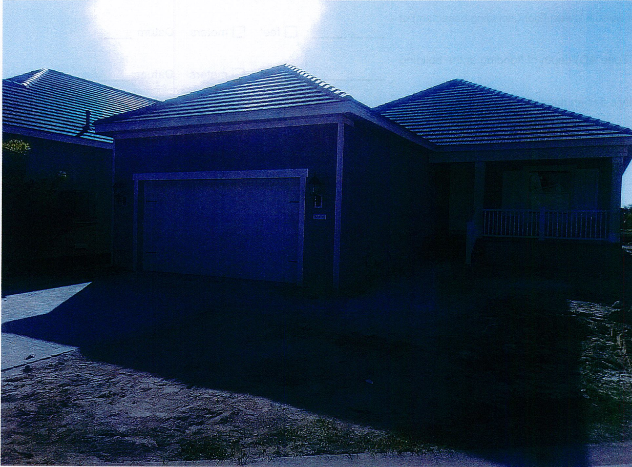
Rear View (02-08-2017)