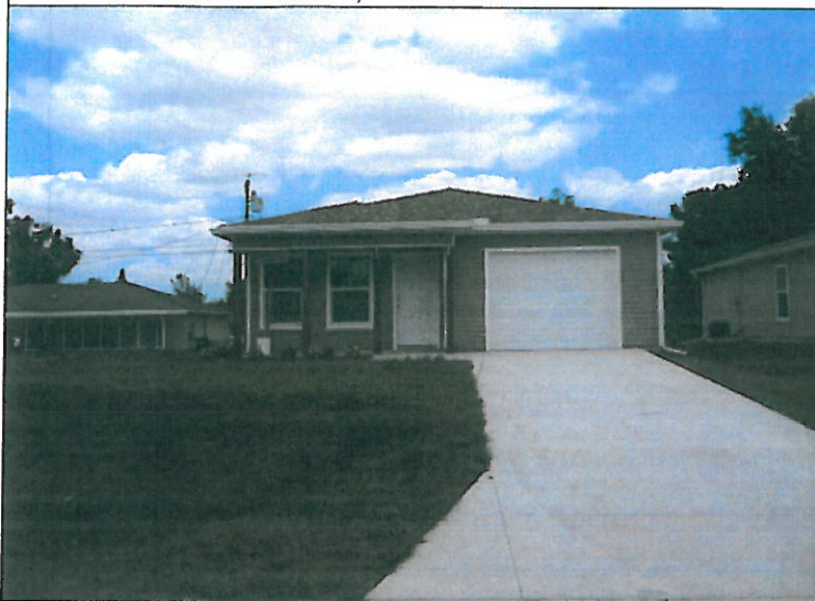
5-18-15; FRONT VIEW