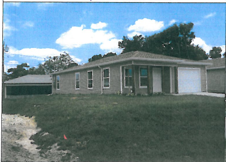
5-18-15; LEFT SIDE VIEW