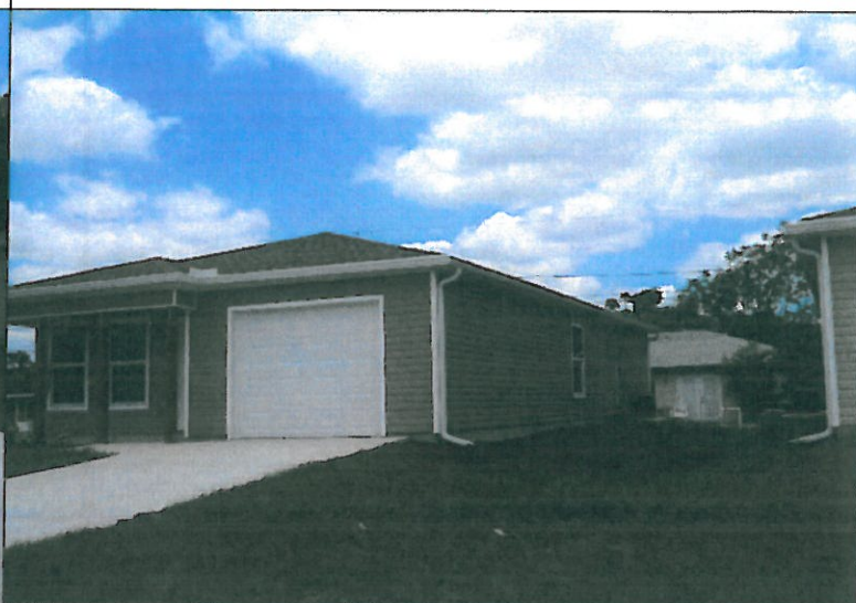
5-18-15; REAR VIEW