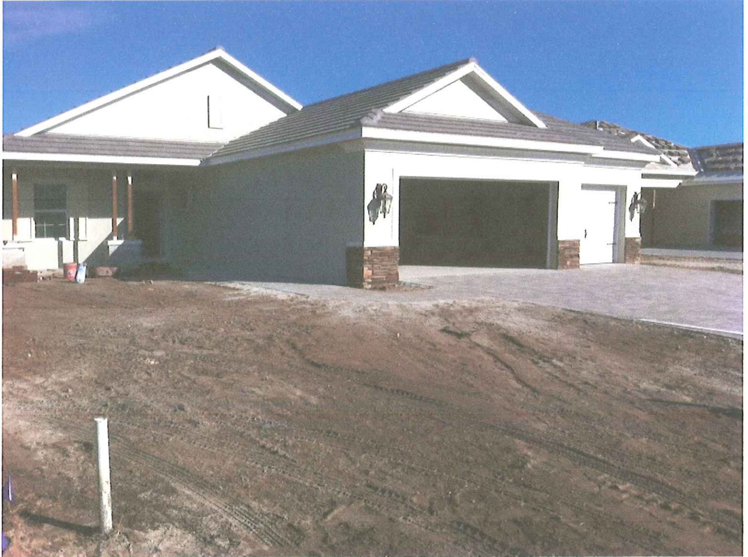
FRONT VIEW 10/18/13

If using the Elevation Certificate to obtain NFIP flood insurance, affix at least 2 building photographs below according to the instructions for Item A6. Identify all photographs with date taken; "Front View" and "Rear View"; and, if required, "Right Side View" and "Left Side View." When applicable, photographs must show the foundation with representative examples of the flood openings or vents, as indicated in Section A8. If submitting more photographs than will fit on this page, use the Continuation Page.