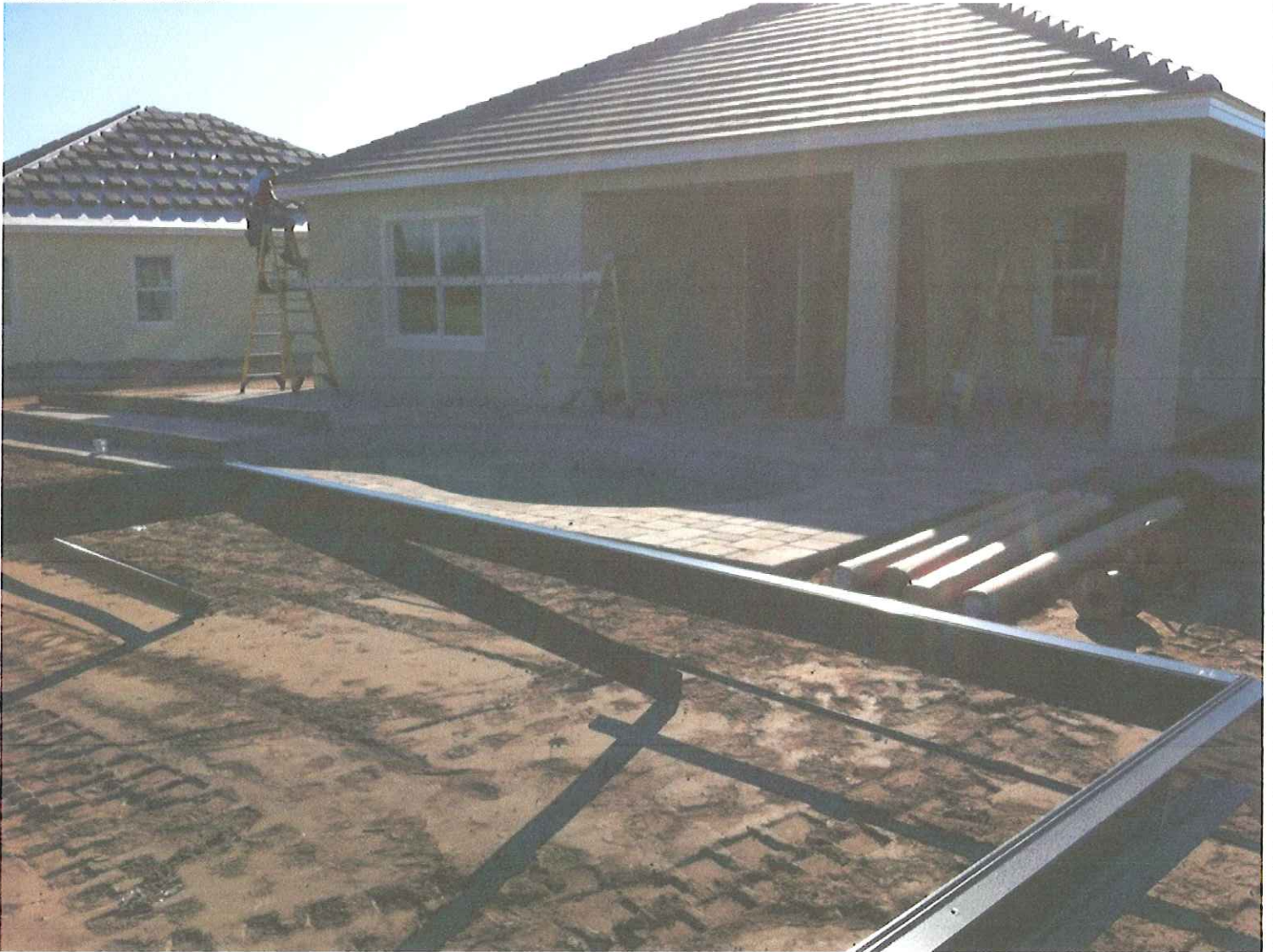
REAR VIEW 10/18/13

If submitting more photographs than will fit on the preceding page, affix the additional photographs below. Identify all photographs with: date taken; "Front View" and "Rear View"; and, if required, "Right Side View" and "Left Side View." When applicable, photographs must show the foundation with representative examples of the flood openings or vents, as indicated in Section A8.