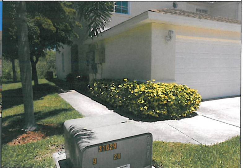
7-1-15; LEFT SIDE VIEW