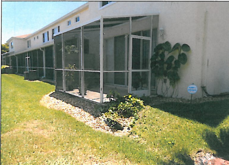
7-1-15; REAR VIEW