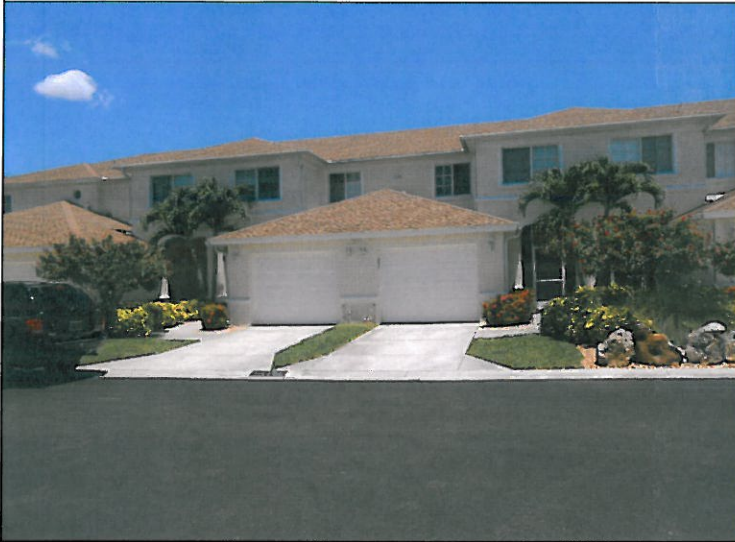
7-1-15; FRONT VIEW