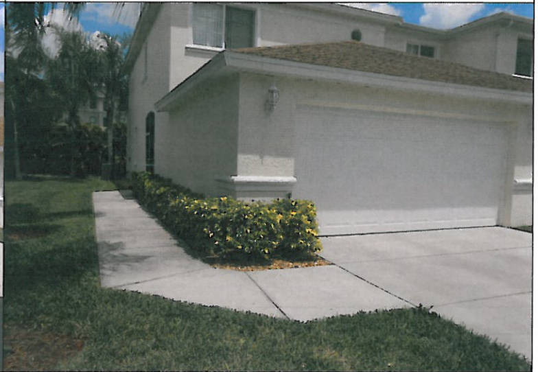
7-1-15; LEFT SIDE VIEW