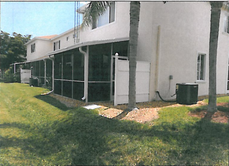
7-1-15; REAR VIEW