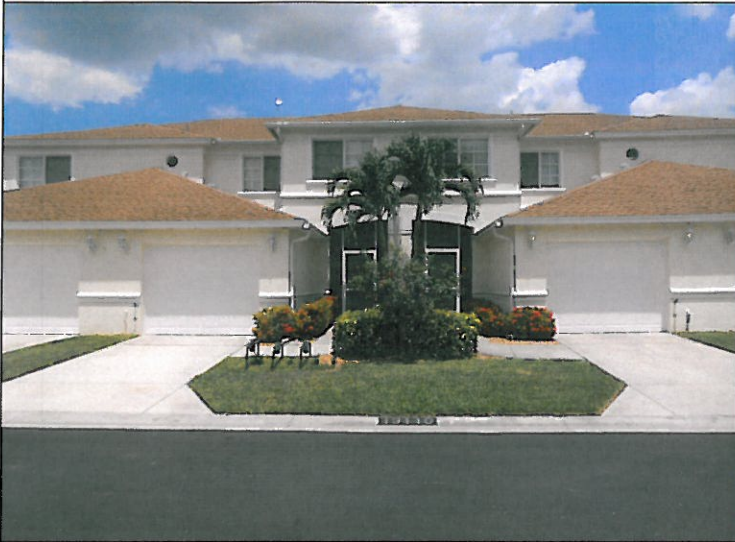
7-1-15; FRONT VIEW