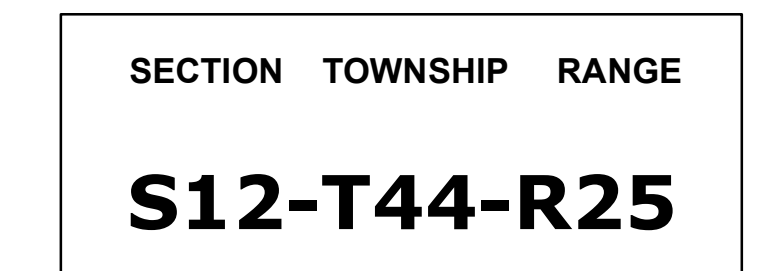
Image prepared by Pictometry International Corp. License No. LB7771

Maps and documents made available by the Lee County Property Appraiser's Office are created as part of a Geographic Information System (GIS) that compiles records, information, and data from various departments, cities, county, state and federal sources. Users are encouraged to examine the documentation or metadata associated with the data on which this map is based for information related to its accuracy, currency, and limitations. Pictometry's Standard Product Individual Orthogonal Imagery frames (4" GSD) meet or exceed National Map Accuracy Standards at a scale of 1'' = 100' and have been compiled to meet 2.8 feet horizontal accuracy at a 95% confidence interval.